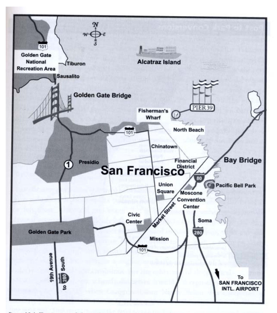
Figure 10.1 Tourist map of places of visitor interest in San Francisco