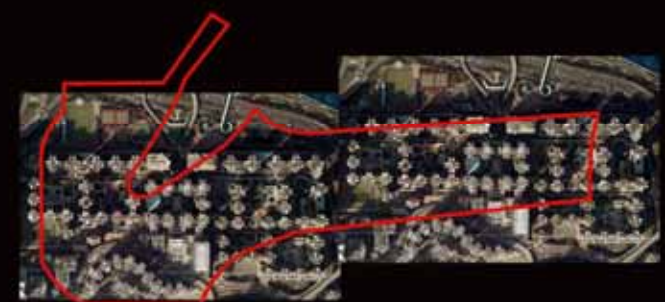
2 x Taikoo Shing 太古城