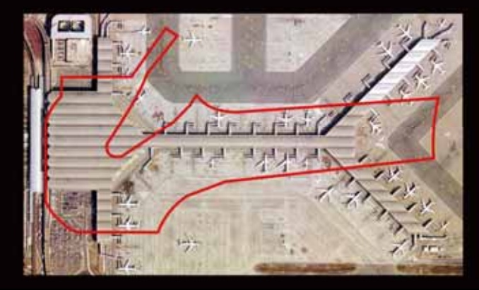
1 x Hong Kong International Airport 香港國際機場