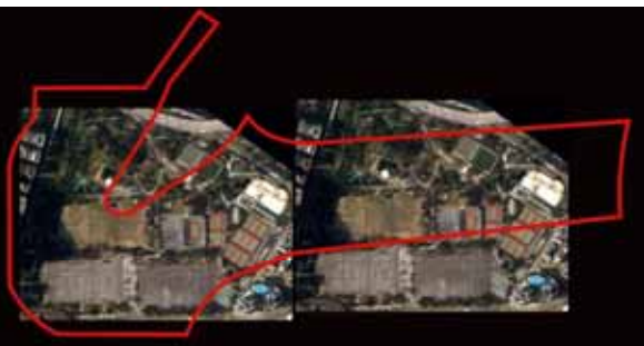
2 x Victoria Park 維多利亞公園