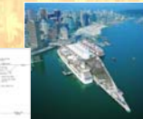
Kai Tak Planning Review Planning with the Community