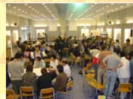
Kai Tak Planning Review Planning with the Community